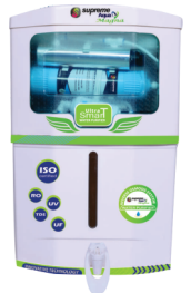
RO Water Purifiers

H.O : Plot no 28C, KIADB Doddaballapura industrial area, Bangalore India - 561203.