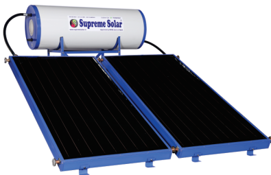
FPC Solar Water Heaters