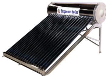
ETC Solar Water Heaters Full SS