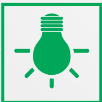
Home Lighting System